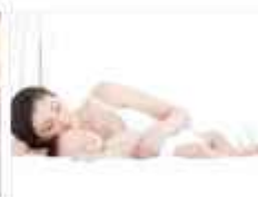
Improves Sleep Quality