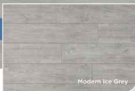
Modern Ice Grey