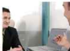
Improves Mental Concentration & Performance