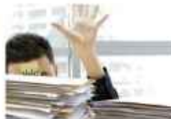
Reduces Stress and Ease Anxiety