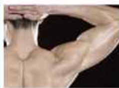
Strengthens Immune System