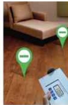
Negative Ion Technology Floor - 1000 per \text{cm}^3