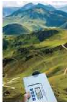
Hill top - 1980 per \text{cm}^3