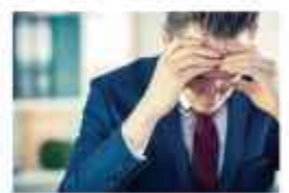
Recovers from Tiredness Speedily