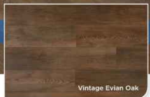
Vintage Evian Oak