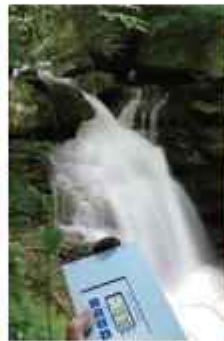
Waterfall - 7070 per \text{cm}^3