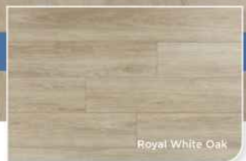
Royal White Oak