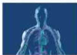
Promotes Blood Circulation