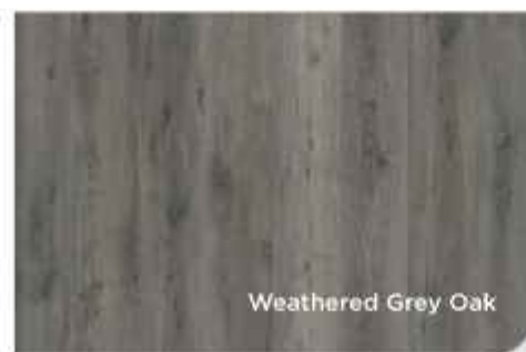
Weathered Grey Oak

Pioneering ultra-modern floorboard color choices of a younger audience, Weathered Grey Oak has washed out grey tones with occasional streaks of honey.