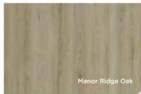
Manor Ridge Oak

Fit for all round use, Manor Ridge Oak provides a slight brown and orange tinge to classic oak floorboards.