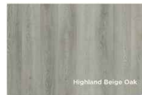
Highland Beige Oak

As a light beige colored floorboard, the eye-catching dark grain of Highland Beige Oak is perfect for adding contrast to any room.